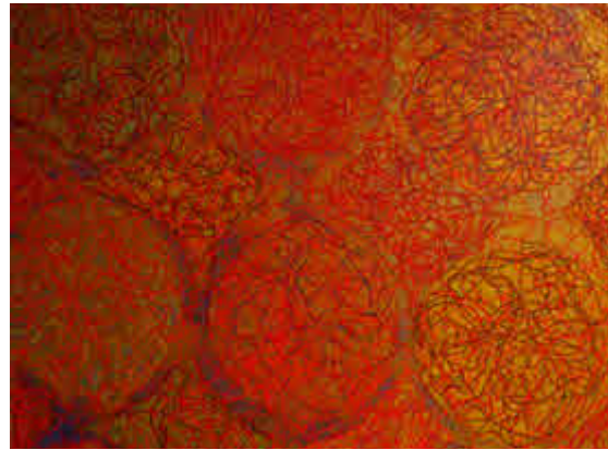
Detail of Cosmic dust red , 2009, oil and gloss on canvas © Kengo Kita