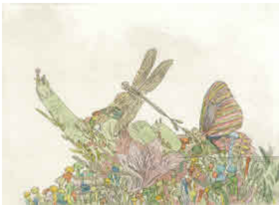
Green Finger , 2008, etching, Japanese paint © Gemma Anderson