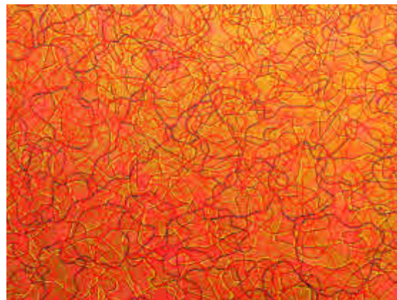
Detail of Cosmic dust gold , 2009, oil and gloss on canvas © Kengo Kita

Kengo Kito has become one of the leaders of a new generation of Japanese artists. He is well-known for large installations using common industrial materials; however he has recently been creating a series of new paintings using images from fashion magazines. The original meaning and context that reflect the superficial society are lost and transformed into sublime abstract movements on his canvas.