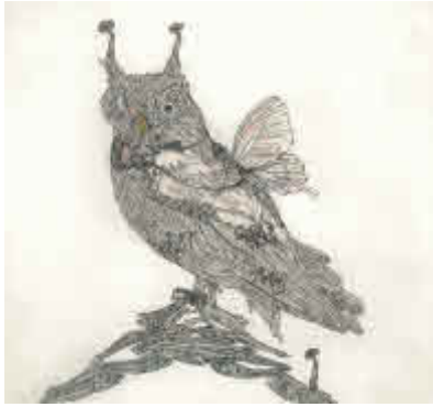
Ezo Owl, 2008, etching, Japanese paint