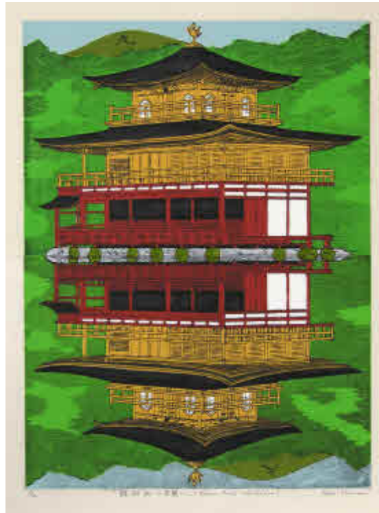
Mirror Pond - Kinkaku - 2009 woodcut print ©Nana Shiomi

Nana Shiomi makes contemporary woodcut prints, often using traditional Japanese icons. Her printing technique is based on the traditional Japanese way of printing, but with new materials and tools.