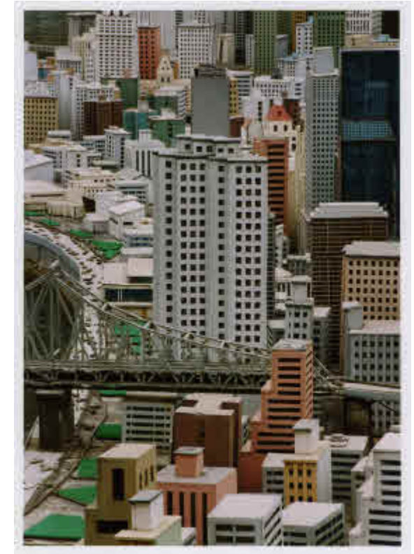
New York/Window of the World , 2006, C-print © Naoya Hatakeyama

Naoya Hatakeyama is based in Tokyo, a city which continuously fuels his interest in the relationship between nature, the city and photography. The exhibition will showcase his masterworks, Scales , commissioned by the Canadian Centre for Architecture (CCA), which explores the concepts of scale and perception of reality through architectural models. Hatakeyama represented Japan in the 49 th Venice Biennale and his works can be found in various public collections including the V&A London.